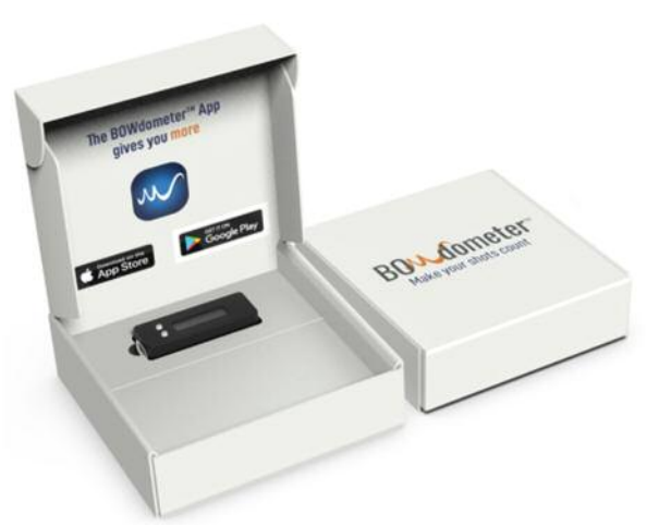
It may be small but it will have a big impact on your consistency.

Velcro straps, zip ties, or screwing the supplied mount into an unused stabilizer hole or your unused secondary plunger hole. In my experience, the more solid you can make your connection to your riser, the more accurate the data will be for your shot rating (as there is less random movement of the BOWdometer). A solid connection required me to screw the mount to the riser and I used the